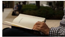
Researchers Develop Tech to Read Closed Book