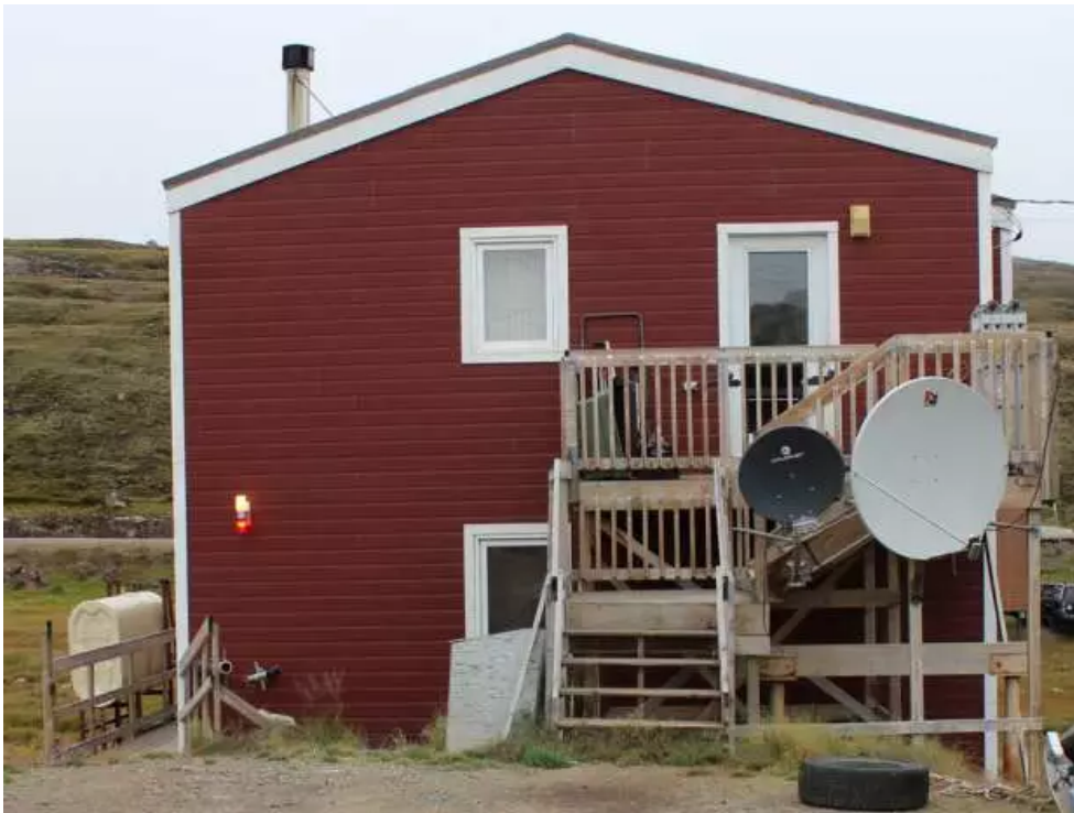
Emily Jackson for National Post

IQALUIT — Eager Nunavummiat waited in line for hours to sign up for the territory's first mobile network that supported smartphones when Ice Wireless launched its offering in Iqaluit a few years ago.