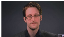
Rights Groups Ask Obama To Pardon Snowden