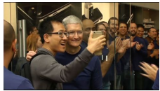
Tim Cook Greets Apple Fans Waiting for iPhone 7